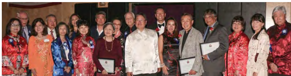
CACS Council & Foundation Board Members and Founding Members