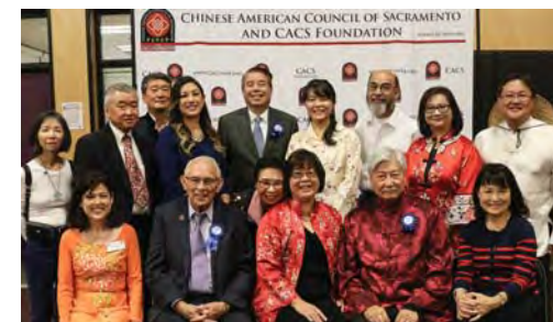
CACS Council and Foundation Board Members