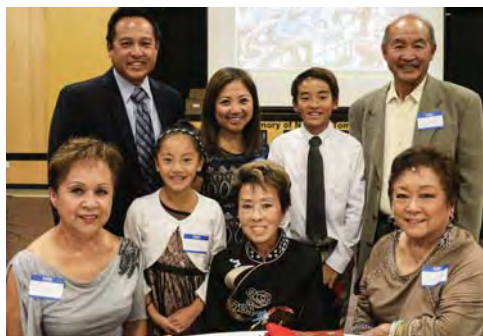
GMC Gold Sponsor - Fat Family