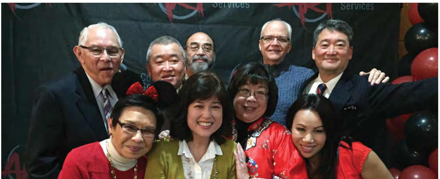
CACS Board of Directors supports ARI Lunar New Year Dinner on 2/26/17 at the Happy Garden Seafood Restaurant