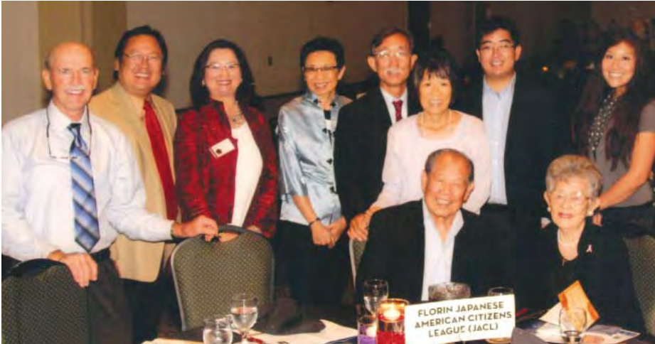
At the Council on American Islamic Relations - Sacramento Valley (CAIR-SV) fundraising dinner at CSUS on Sept. 6, CACS shared a table with Florin JACL.